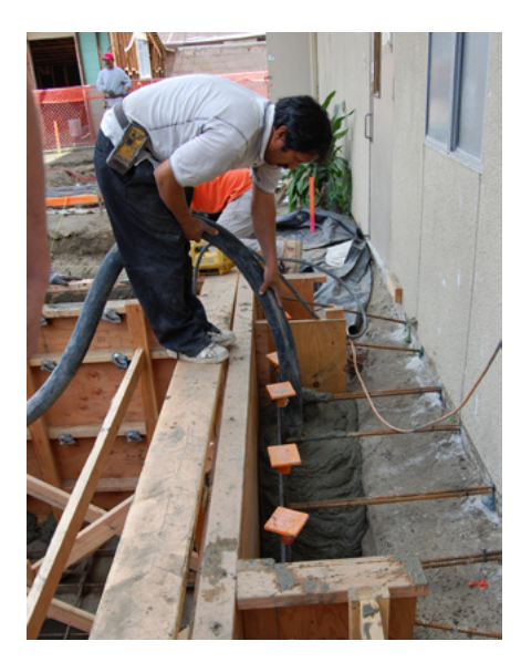
Pouring the elevator pit walls and footings

This past week the Los County Fire Department approved the plan for the fire alarms and smoke detectors. The