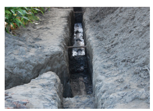
The broken sewer pipe from the house